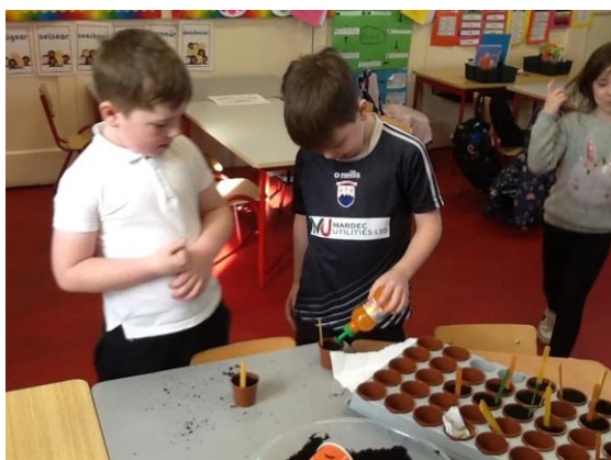
Junior room learned about what plants need to grow!