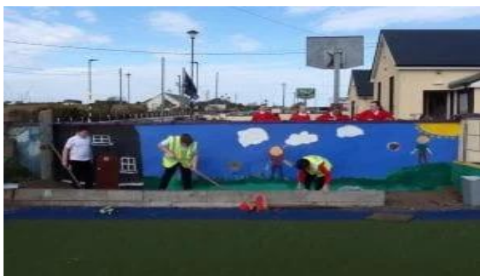
Final touches before the transfer of plants in a few weeks.