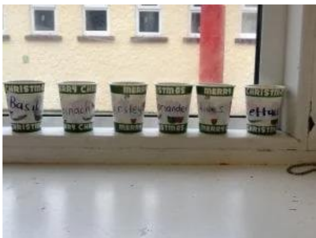
Seed cups in the senior room