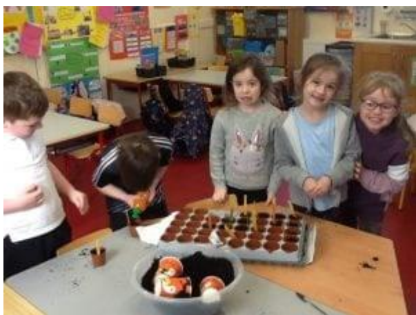
Junior room planting their seeds.