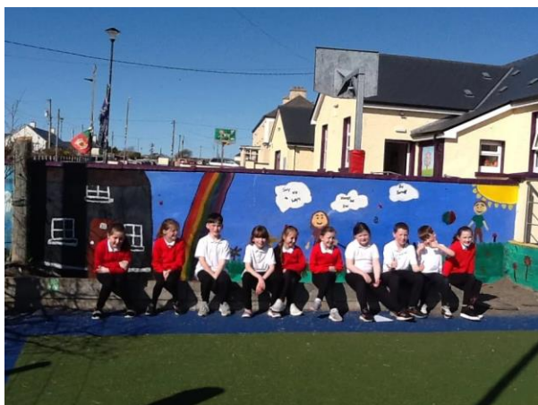
Proud of the finished design