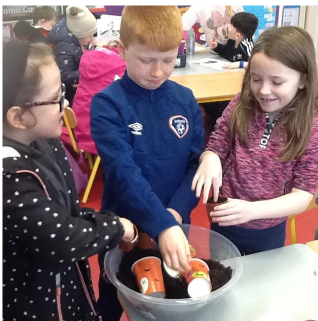
Fun sensory play with soil.