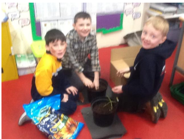
Planting their Strawberry plant.