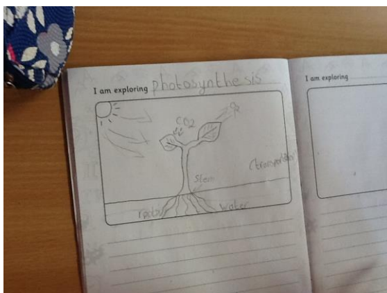
We learned all about Photosynthesis in the Middle and Senior Room