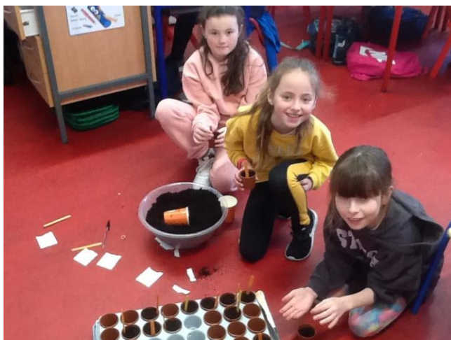
Choosing their seeds.