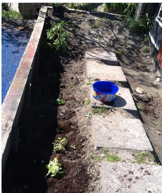
Plants are transferred to Garden.