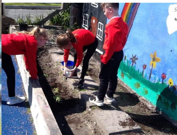
Watering the plants outdoors!